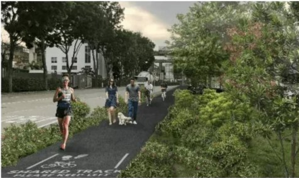
Artist's impression of future Pasir Panjang Linear Park © National Parks Board

One Faber Group is studying a new funicular system at Mount Faber to bring visitors from the foothills to the hilltop and cable car station by 2023. This provides easy access to Mount Faber and the rest of the 10km-long Southern Ridges.