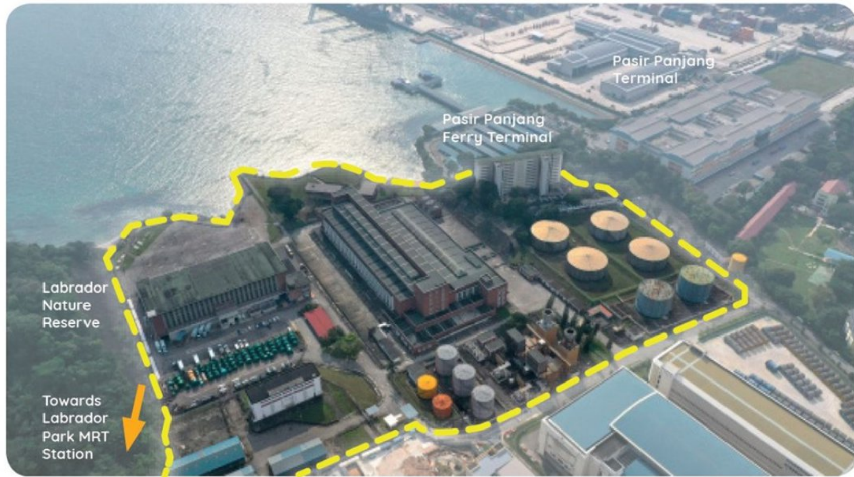
Aerial View of Pasir Panjang Power District

Built in the 1950s and 60s, the two former power station buildings, along with the surrounding disused industrial structures, form the core of the Pasir Panjang Power District. With its waterfront setting and rich industrial heritage, the district can be transformed into an extraordinary destination for all to enjoy. “Power-Up Pasir Panjang”, a call for public ideas to envision future possibilities for this unique site and to celebrate its distinctive heritage, was held from 30th April 2019 – 25th June 2019. Useful ideas and concepts will be distilled into design principles and the brief for the subsequent use of the power district. An exhibition showcasing the creative submissions will be held at a later date. Stay tuned for more details.