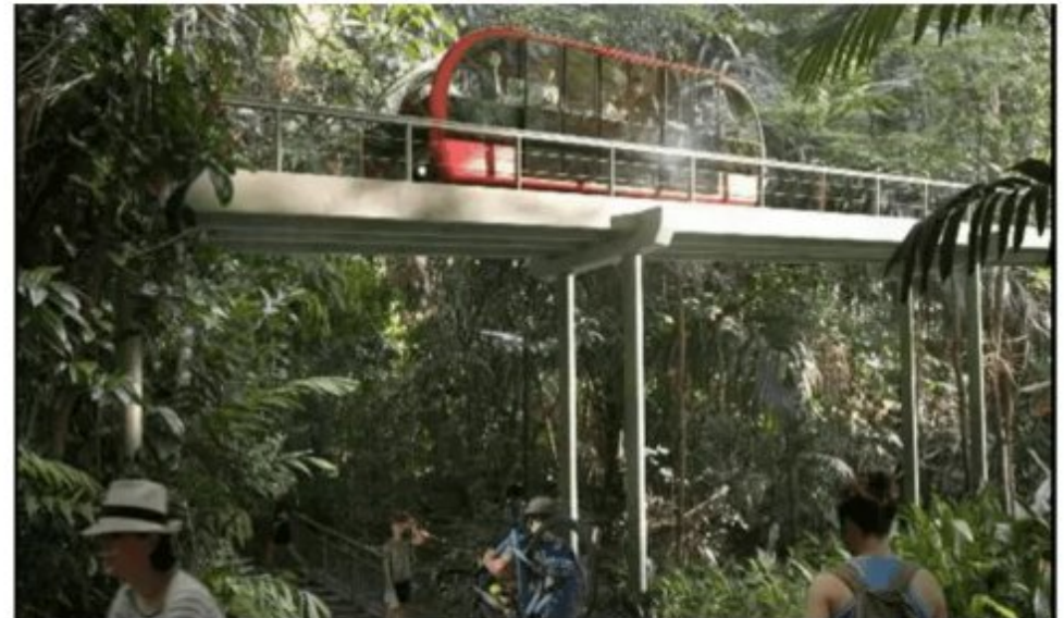
Artist's impression of New Funicular